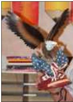
The Eagle Attendance Award