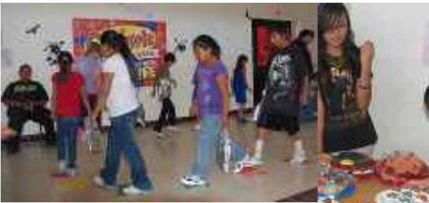
One of the most popular games...the cakewalk