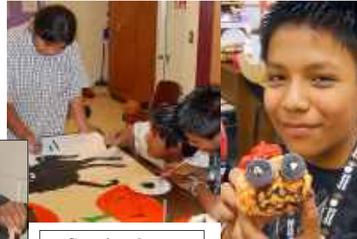
Creating the art work took weeks of work for the students!