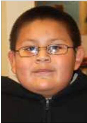
Erale Cowboy, Kindergarten: "...good attendance...good reader...good helper at school..."