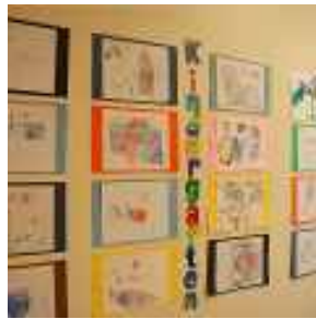
Pre-K through 8th grade participated