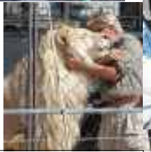
A rare white lion was part of one exhibit