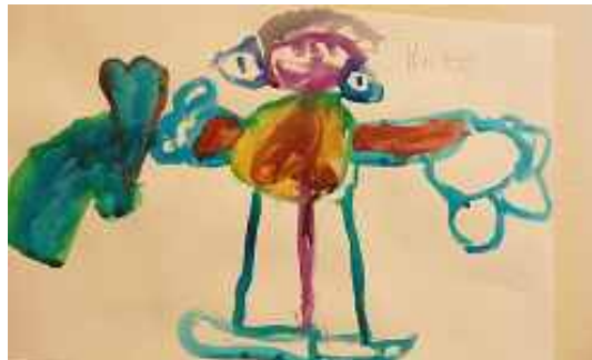
Best of Show was this picture by Hailee Sam, Kindergarten