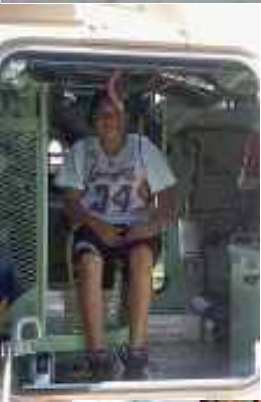
A Chinese acrobat shows her limber style