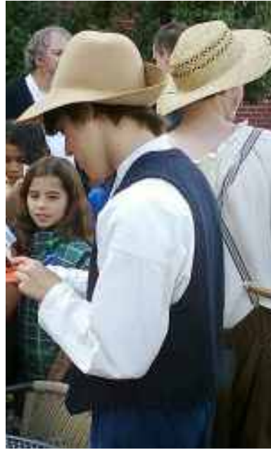
Actors from "Tom Sawyer"