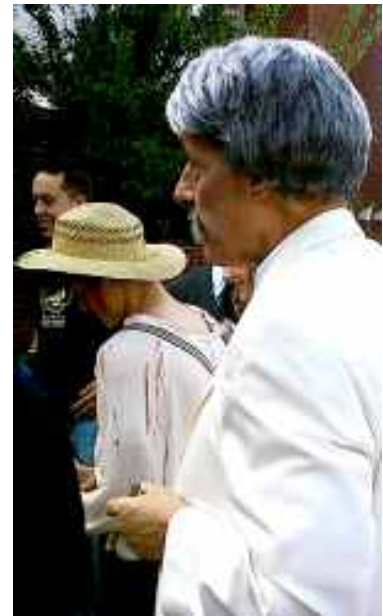
Actors from "Tom Sawyer"